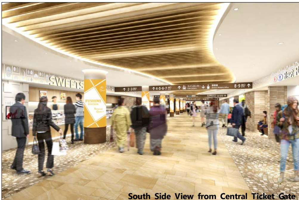
South Side View from Central Ticket Gate